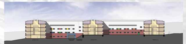
PROPOSED HOUSEBLOCK LONG SECTION